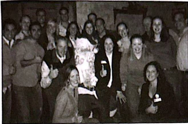
Cass of 2000+ Ags pose for a picture with Santa at the Annual Christmas Party.