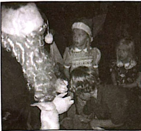
Santa hands out presents to all the good little girls and boys.