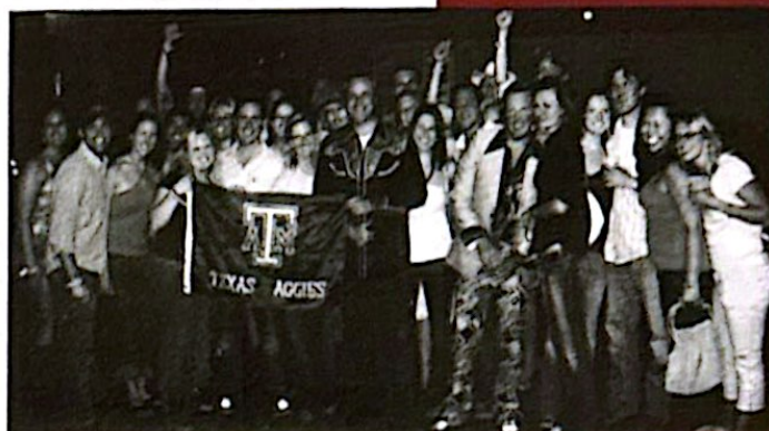
The Denver Aggies enjoyed a night out on the town watching the Robert Earl Keen concert at the Fillmore Auditorium.

On August 12, Denver Aggies gathered at the Fillmore Auditorium for a Robert Earl Keen concert. Keen, a fellow Aggie (class of '80) and well-known Texas Country singer, was kind enough to donate a number of autographed items including T-shirts, caps, framed photos, backstage meet-and-greet passes, and CDs for a silent auction. Proceeds from the auction exceeded $600 and went to benefit the scholarship fund. After the concert, Keen joined us for a picture with our Aggie flag, which was submitted to the Association of Former Students. This photograph can be seen on page 16 of the January-February issue of the Texas Aggie magazine.