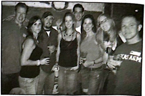
Aggies enjoy Big 12 Happy Hour with other university alumni on the roof-top of Lodo's downtown.