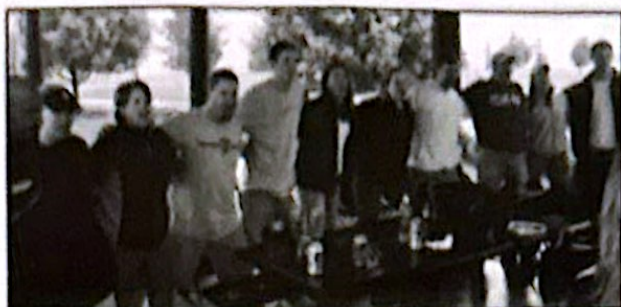
Rain or shine, the Aggie War Hymn is always a favorite at Club gettogethers.

At the annual Club picnic in July, 35 folks braved the inclement weather to meet up at Cuernavaca Park. Though the Kickball Extravaganza was cancelled due to rain, the folks who came out enjoyed Dickey's BBQ, shared Old Army stories, and conducted a little Club business.