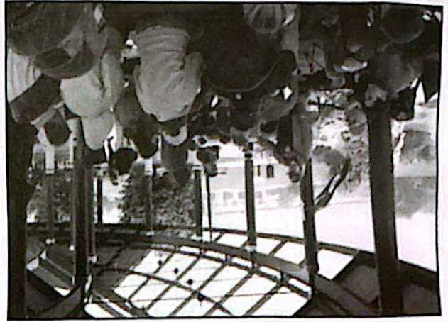
Aggies brave the cold rain to gather at Cuernavaca Park for the Summer Picnic.