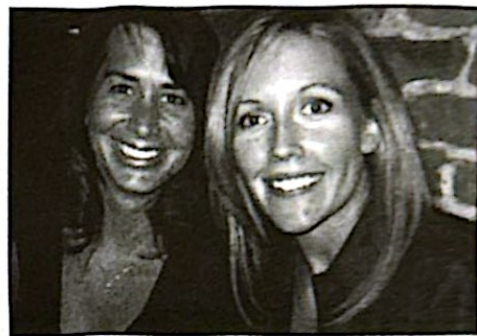
Aggie gals having fun at Lodo's downtown.

membership growth. While the membership totals have fallen off slightly, the club is still going strong with over 200 members as of December. However, the Club's e-mail list continued to increase in size with over 570 members on the list.