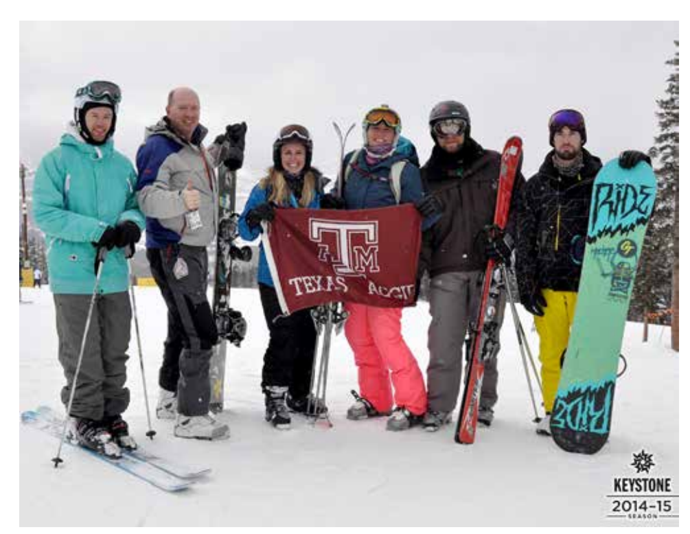
Aggies skiing at Keystone Resort.

If you would like to be added to our email distribution list to receive reminders about events and monthly email newsletters, please send us a message to denver. aggie-subscribe@ yahoogroups.com.