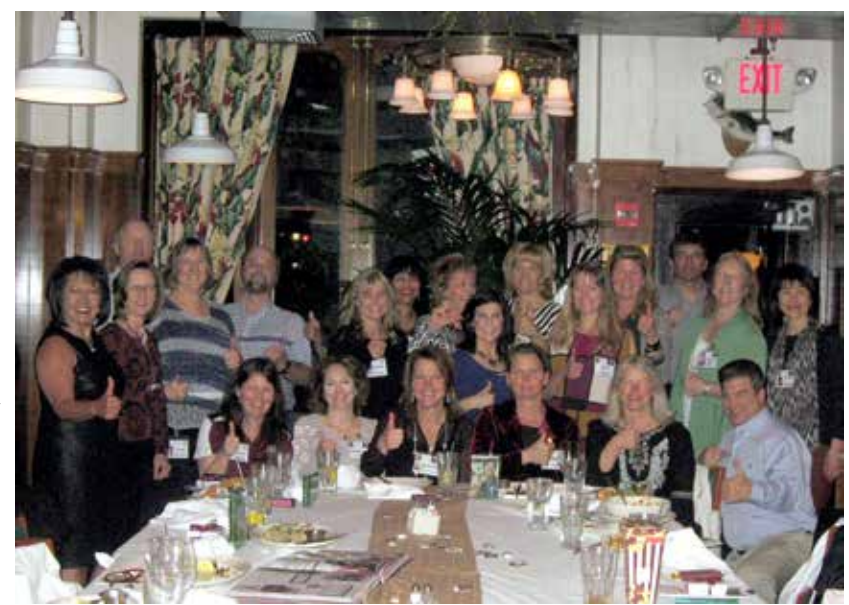
Aggie Moms gather at their Aggie Graduation Celebration in May 2014.

• At each meeting we introduce new members, share ideas and answer any questions we have regarding our students and their welfare. It is always a very informative time for the Moms to learn what is happening in Aggieland, discuss traditions and any questions we have about campus life. To end the meetings we are led in a