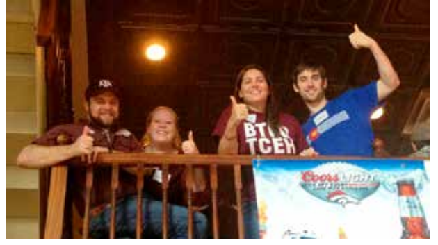
Ever faithful Denver Aggies regularly gathered during 2014 for the Watch Parties.

The Fainting Goat was packed for the start of the college football season as Aggies from around Colorado came together to see a dominating win at South Carolina. The Ags also had exciting victories over Arkansas and Auburn, and ended the season with a win against West Virgina in the Liberty Bowl! We look forward to seeing all of you on Saturday, September 5, when the Aggies take on Arizona State.