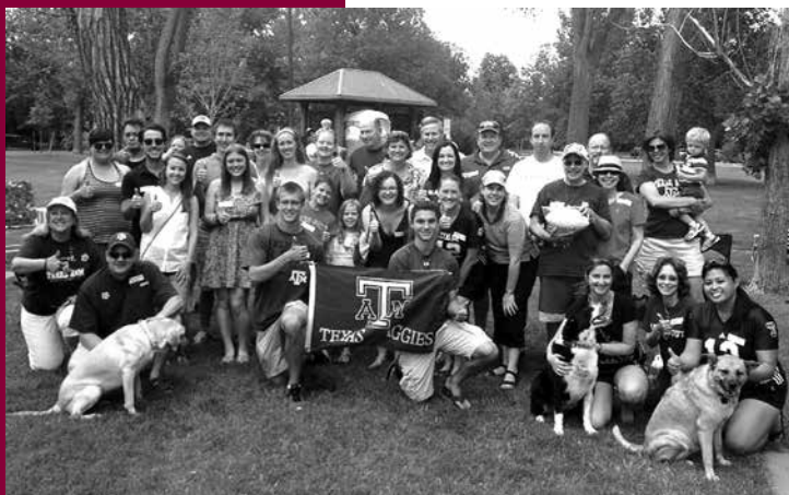
Above: "Denver Aggies gather for the Annual DAMC Picnic and Freshmen Send Off"