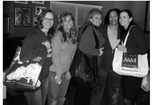
Denver Aggies Moms preparing finals goody bags

If you are interested in or want more information about the Denver Aggie Moms Club, please e-mail denveraggiemoms@gmail.com or find us on Facebook at www.facebook.com/groups/denveraggiemoms . Our Denver Aggie Moms Club website is denveraggiemoms.aggienetwork.com . New members are welcome at any time.