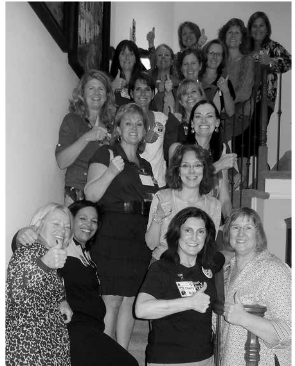
Denver Aggies Moms having a great time at the annual Christmas ornament exchange