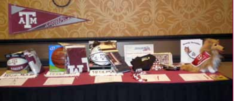
Auction items on display at the 2008 Muster.

Items less than $10 in value may be bundled together for auction purposes. Please contact Sarah Spivey at aggie00_sarah@yahoo.com or 720.579.4920 if you are interested in donating to the silent auction.