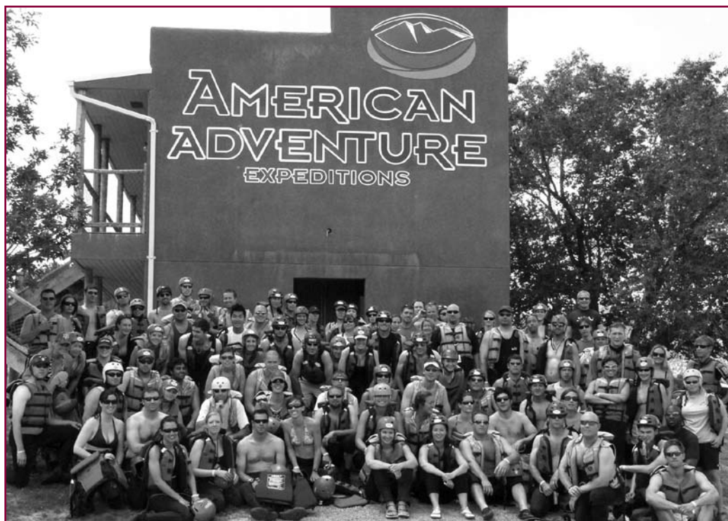
Eighth annual rafting trip (Class Five Chaos) group—120 total with about 70 Aggies

Have you joined our main club e-mail list yet? The best way to stay informed about club events is to join our e-mail list. All you have to do is send an e-mail to mydenveraggies@yahoo.com and ask to be added today!