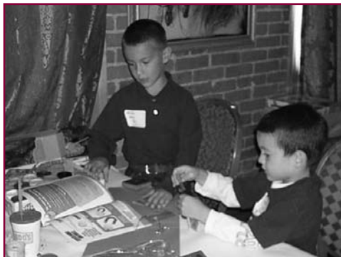
Crafty Aggie kids enjoy coloring at a DAMC event.

The Easter celebration was held at Amy and Ian Miller's house again in 2008 and it was an outstanding success. Over 300 eggs were stuffed and hidden and 13 kids did such an excellent job of finding the eggs that they even found one hidden at last year's Easter event. Food included donuts, granola bars, water, juice, coffee, fruit, mini bagels and cream cheese. The event started at 10 am and the hunters were released just after 11 am. Amy and her daughter created three golden tickets which were hidden inside selected eggs. These tickets, when found, earned the hunter a special prize. Prizes included a gorgeous fun-filled Easter baskets and chocolate golden eggs. After the hunt, the kids enjoyed some indoor craft activities as it was sunny but very chilly outside. The kids decorated two dimensional foam Easter eggs and constructed bookmarks with foam chicks and lambs glued to colored tongue depressors. The DAMC Easter celebration is shaping up to be an annual family event tradition!