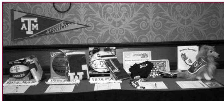
Auction items on display at the 2008 Muster.